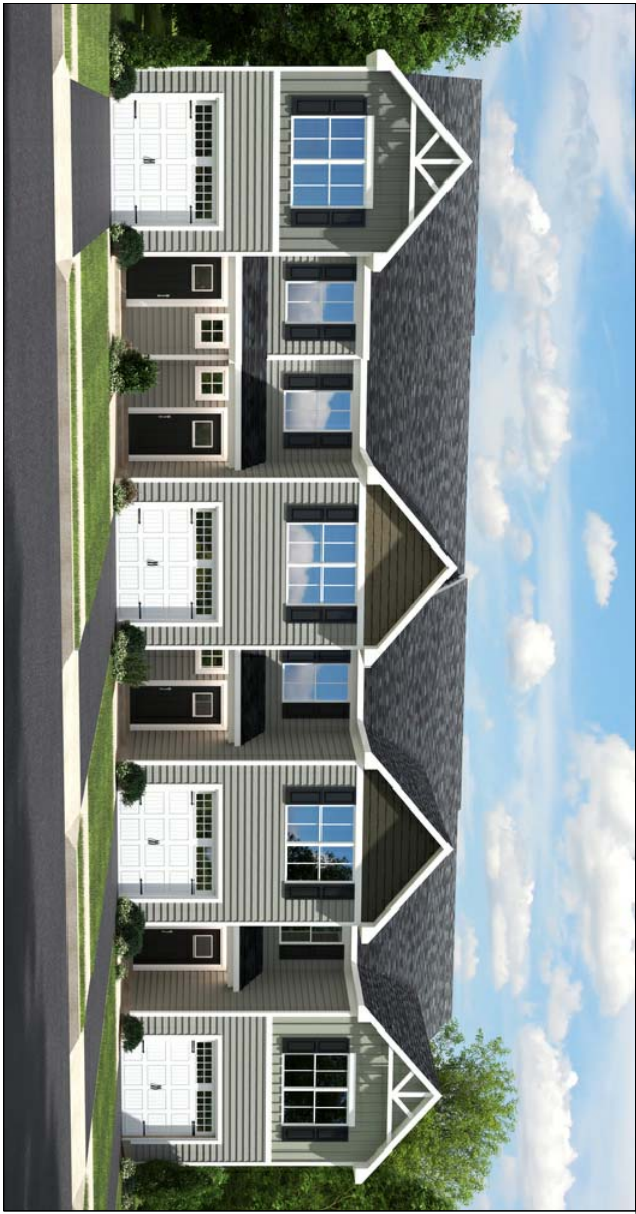
TYPICAL BUILDING ELEVATION